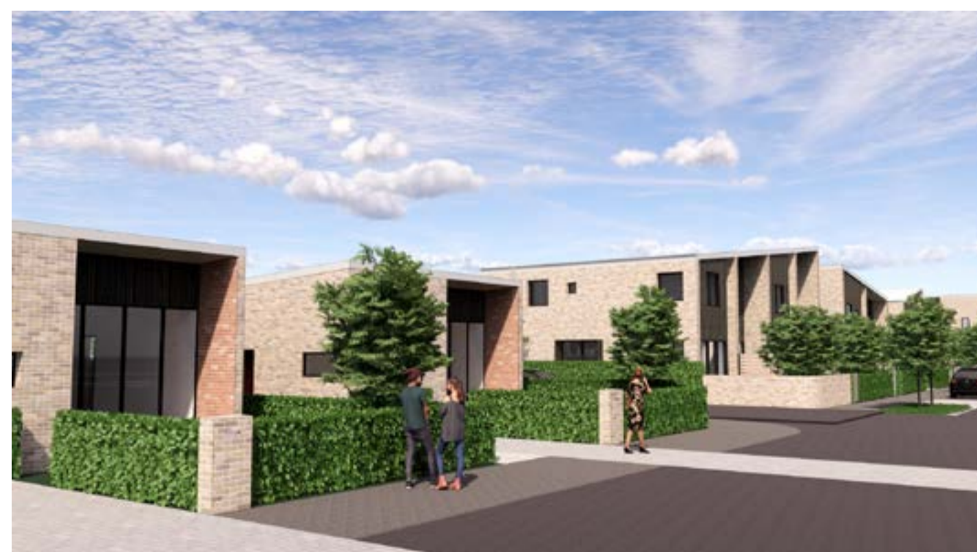
3 one-storey kaumaatua homes