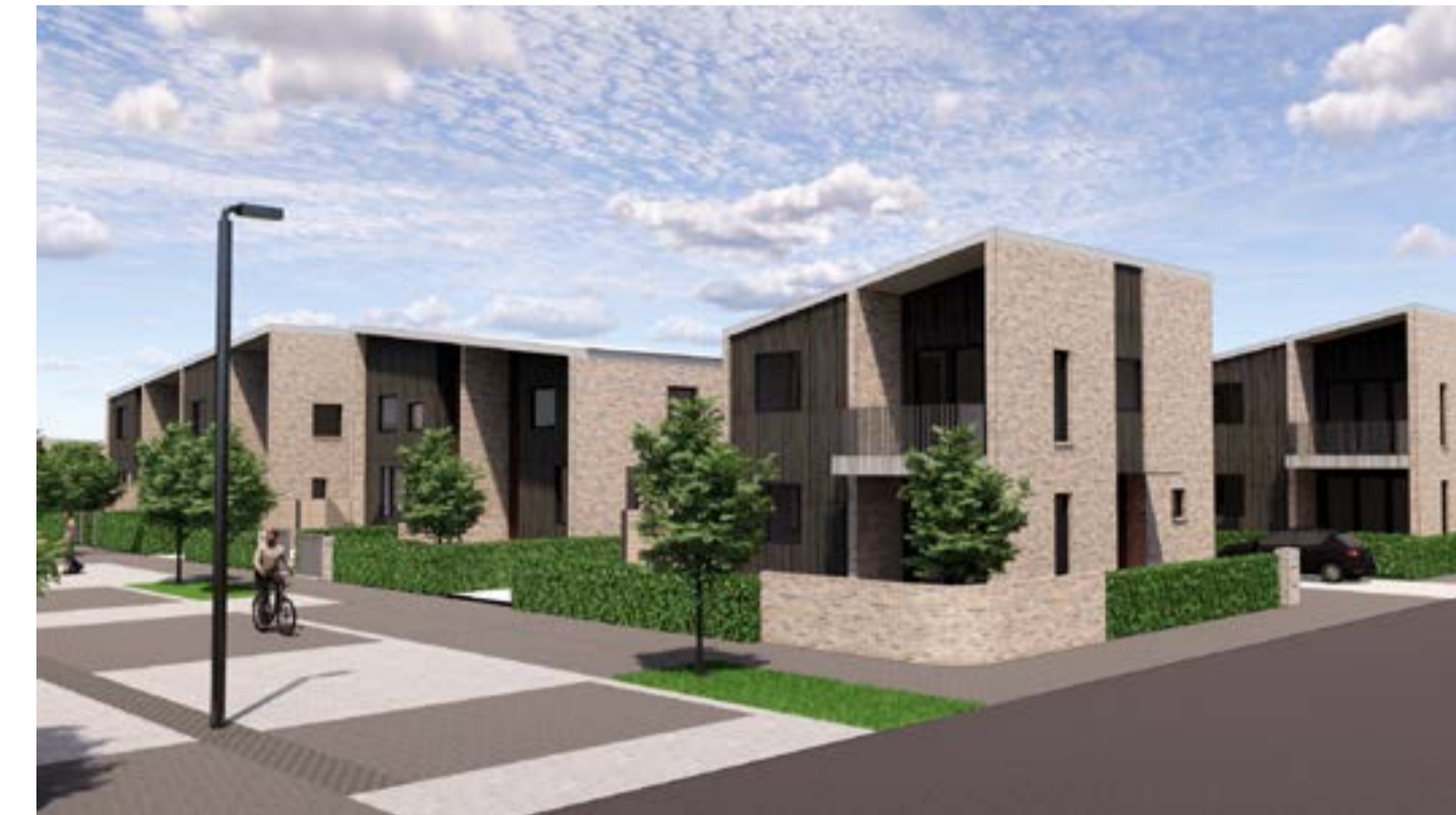
The homes will have outdoor space, and some will also have balconies