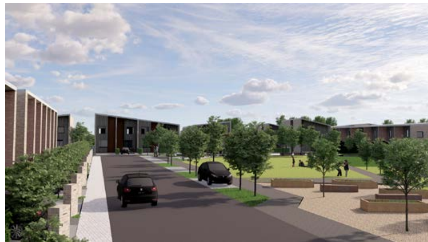
Internal park with homes surrounding

Community drop-in session, 15 April 2021