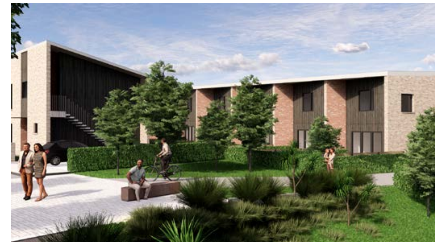
Two-bedroom terrace homes