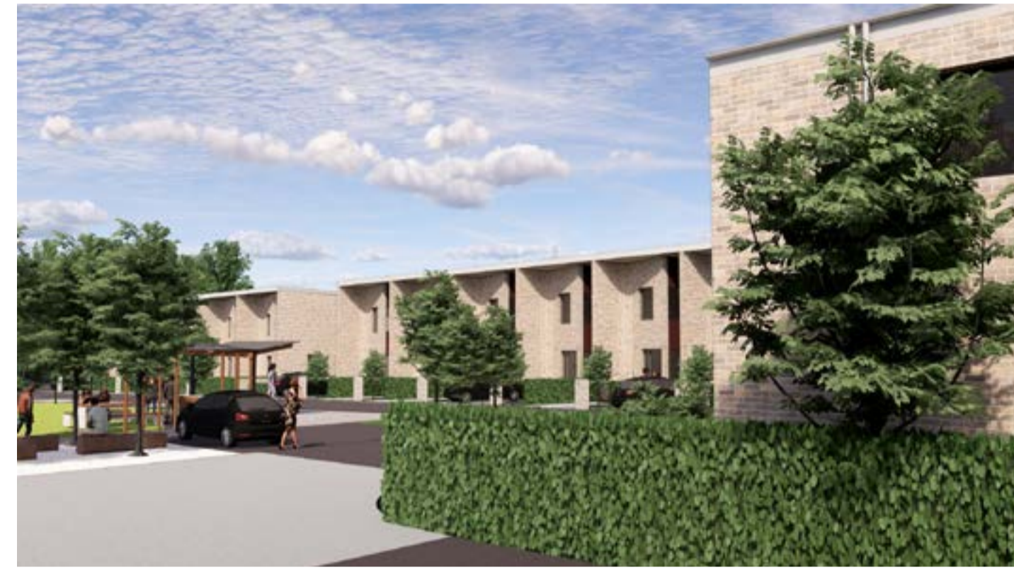
The two-bedroom terraced homes