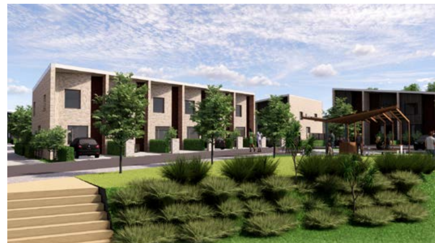
View from park to two-bedroom terrace homes