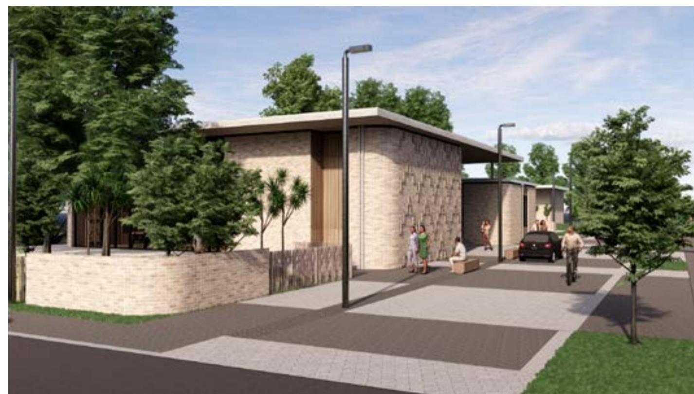
Shared internal street for vehicles and people on foot and bikes